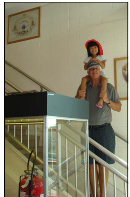
Below: There's always some great photo opportunities, inside or outside the Museum!